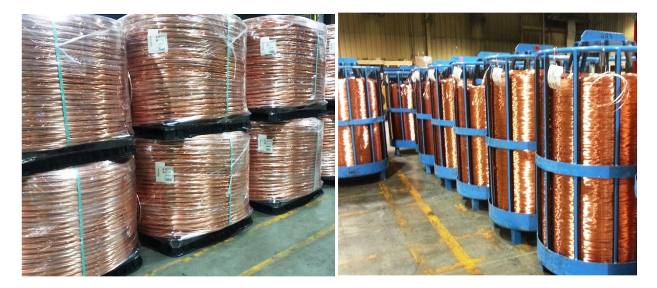
Figure 1. Copper Rod (left) and Copper Wire (right) Made at Essex Furukawa

Copper has been widely used for electrical and electronic applications in industries and in our daily life. Copper usually is the first metal for considerations in such applications because its unique combinations of performance and availability. Copper has highest electrical conductivity after silver among all other metals whereas it has a relatively low cost with abundant resources.